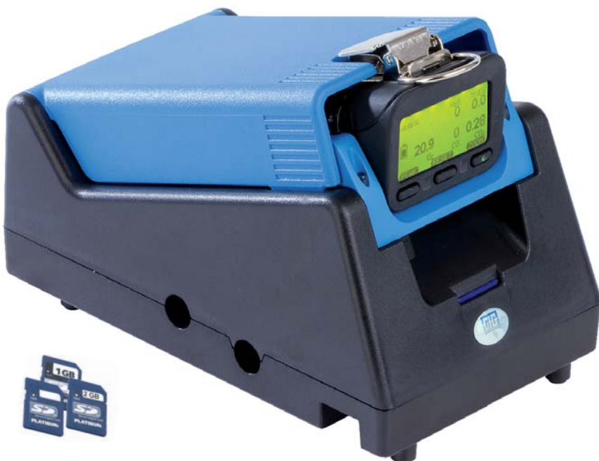
SD-cards: permanent data-logging for up to 45 years

When the pump is turned on the diffusion inlets are covered and the measurement results are not affected by air flows. An additional filter system in the sampling line protects the pump and sensors from dust and moisture. When the pump is turned off, the gas detector can be operated as usual. The diffusion