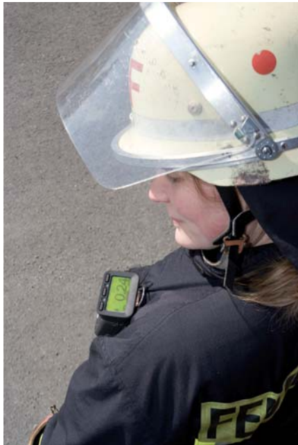
Reversible display always visible

tions, so working life and maintenance requirements are minimized. This gives the user far lower servicing and operating costs.